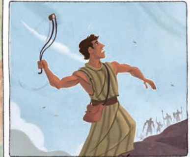
David was anointed and fought Goliath.