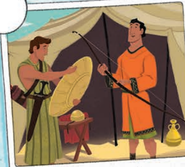
David and Jonathan became friends.

Number the events in the order they happened in David's life.