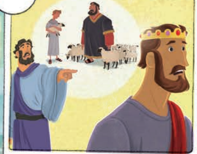
David sinned and was restored.