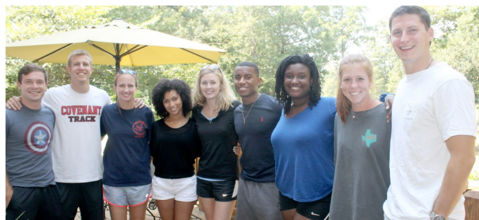
Tribe Fellowship Leadership Team