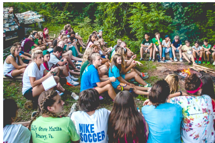
Students serving during the North Carolina Mission Trip