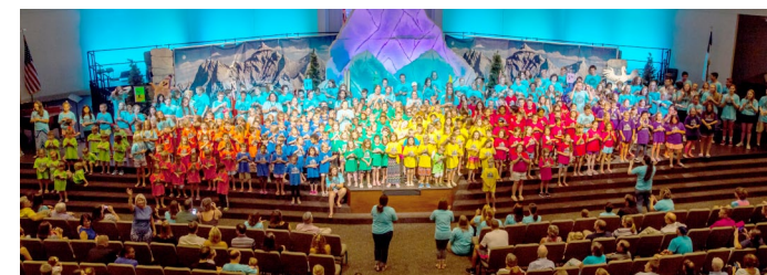
At Vacation Bible School, children learned to "Conquer life's challenges through God's mighty power".

Join us in sharing Jesus and building children's foundation of faith in Him by volunteering on Sunday mornings as a small group leader, worship leader, large group leader, hall monitor, sound tech, or worship buddy! A worship buddy is someone who is paired one on one with a child with special needs. We also have many opportunities in our caregiving rooms during various programs throughout the week. For more information, visit: wcchapel.org/children .