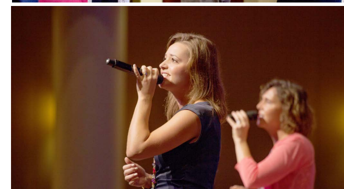
TOP: The Welcome Center in our Main Foyer