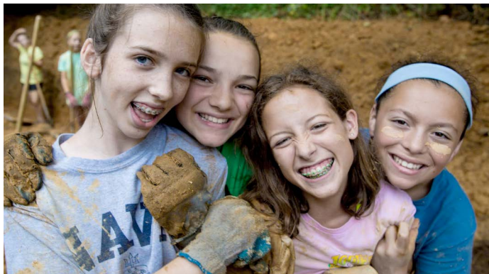
Students serving in Weaverville, North Carolina