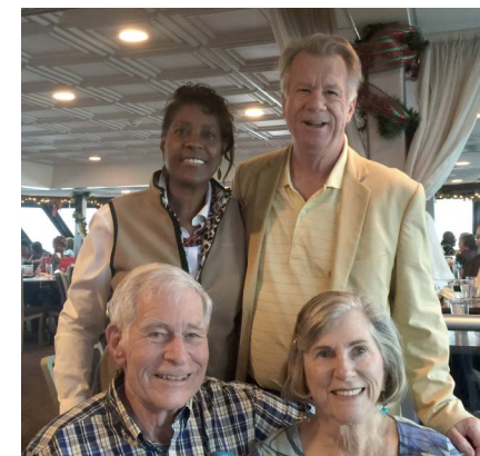
TOP: Marriage Mentor Training Dinner LEFT: Senior Lunch on the Spirit of Norfolk