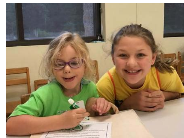
TOP: During Vacation Bible School, 400+ kids and 250+ volunteers participated in Maker Fun Factory: Created by God Built for a Purpose BOTTOM: A Worship Buddies partnership in action.