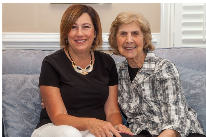
TOP: Our Daily Bread Ministry provides care through meals in times of need. BOTTOM: Hidden Treasures Ministry provides care and friendship for our older adults.