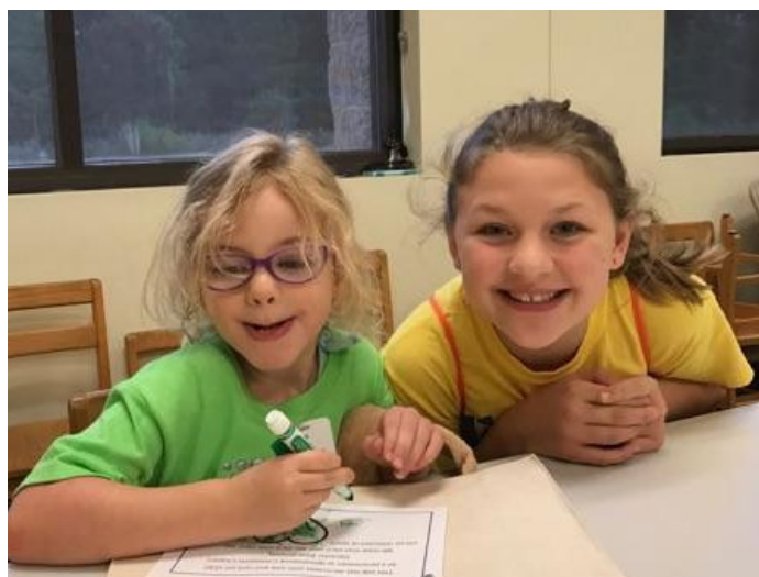
TOP: During Vacation Bible School, 400+ kids and 250+ volunteers participated in Maker Fun Factory: Created by God Built for a Purpose BOTTOM: A Worship Buddies partnership in action.