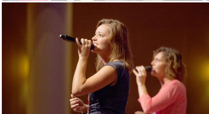
TOP: The Welcome Center in our Main Foyer