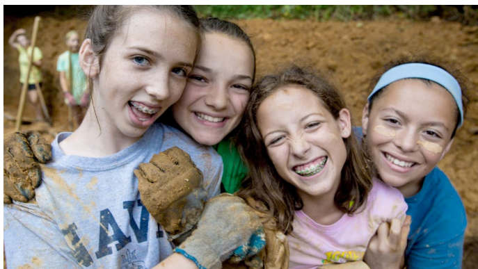
Students serving in Weaverville, North Carolina

Contact: Madeline Duke, 941-1564, mduke@wcchapel.org